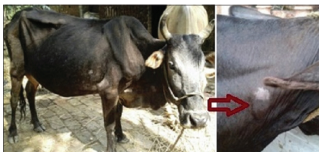
Figure-1: A case of positive Johnin test (delayed-type hypersensitivity) in cattle reared in unorganized farm.

DTH=Delayed-type hypersensitivity, ELISA=Enzyme linked immunosorbent assay