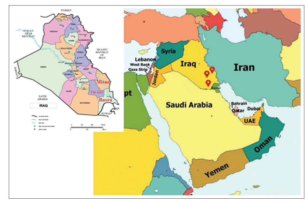
Figure-1: Locations of the study performed on buffaloes in marshes of the south of Iraq.

*Refers to significant variation at p \le 0.05