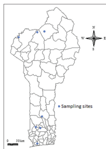
Figure-1: Sampling sites.

Ticks were manually picked with forceps from each animal after they were slaughtered by hunters. These ticks were kept in different vials of 100 ml containing 70° of ethanol. One vial is used per animal species. At the end of each sampling, a tag made of A4 paper with the necessary information (date of collection, sampling area, and animal species sampled) was directly inserted into each vial before it was completely closed.