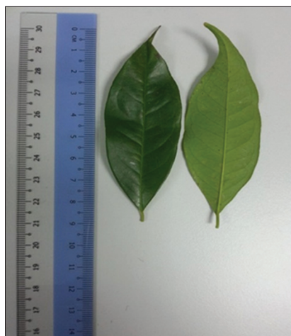
Figure-1: Syzygium polyanthum leaves.

S. polyanthum is known traditionally to treat diarrhea, rheumatism, and diabetes [13,14]. The leaves are freshly consumed as "ulam" by traditional Malay people for the treatment of hypertension and general body health maintenance [15]. In Indonesia, local people often add leaves in culinary preparation because they believe that the plant is beneficial in the management of diabetes mellitus, gout, arthritis, and hypertension [16].