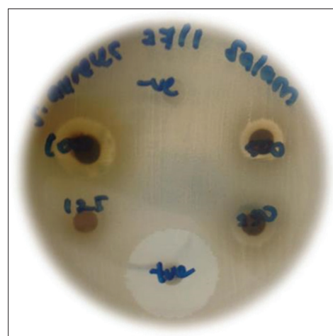
Figure-2: Growth zone of inhibition of some of the bacteria ( Staphylococcus aureus ) caused by Syzygium polyanthum extract.

The S. polyanthum extract shows the largest zone of inhibition at 1000 mg/ml concentration against S. aureus which was 13.5 mm in diameter. The sensitivity reduced as the concentration of plant extract decreased. The treatment effect was time-dependent manner. When compared to the positive control, S. hyicus was the most sensitive toward amoxicillin followed by S. aureus and S. intermedius . On the other hand, 3% DMSO which was used as negative control also failed to inhibit any bacteria.