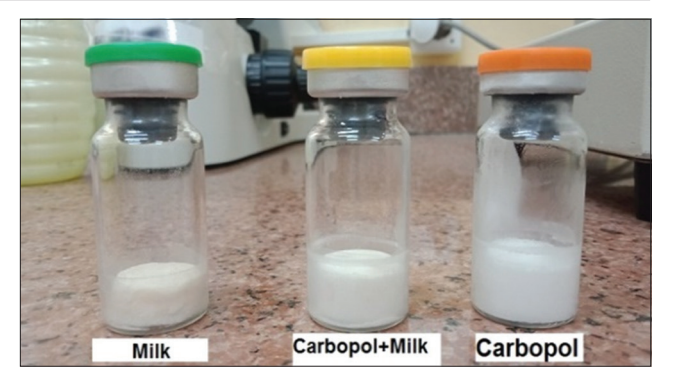
Figure-1: Physical appearance.

Satisfactory levels of protection were achieved in all groups vaccinated with live-attenuated