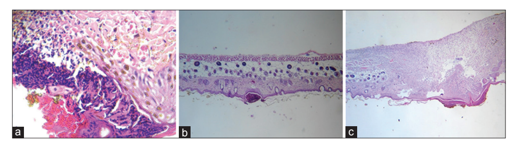
Figure-1: Healing process of the control group with hematoxylin and eosin staining (H and E stain, 40 \times ). (a) Day 1: Loss of epithelium with bleeding and fibrinoid exudate, dense infiltrate of polymorphonuclear leukocytes at the level of the dermoepidermal junction. (b) Day 7: Inflammatory reaction filtered by polymorphonuclear leukocytes and eosinophils, which spread from the superficial dermis to the deepest dermis. (c) Day 15: A large inflammatory reaction to polymorphonuclear leukocytes and eosinophils, which spread from the superficial dermis to the superficial dermis to the deepest dermis.

Latex is used in skin conditions, such as antipyretic, healing of ulcers or wounds on the skin and gastric ulcers, against low back pain, in gastritis, against hernias, herpes, in inflammations of the uterus, malaria, rheumatism, tuberculosis, and tumors [22]. The treated skin with latex appears normal, fairly