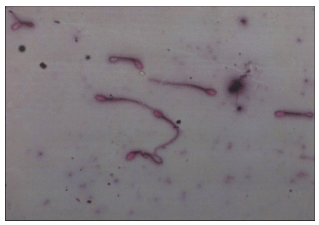
Figure-2: Intact plasma membrane of spermatozoa Intact plasma membrane: Circular spermatozoa tail damaged plasma membrane: Straight spermatozoa tail.