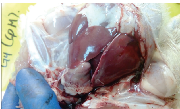
Figure-4: Infected chick with multidrug-resistant-extended-spectrum beta-lactamases producing Escherichia coli treated with cefepime showing slightly congested liver with no to little accumulation of fibrinous materials on the heart, liver, and air sacs.

similar to those observed in the positive control group. In Group 6 (infected and treated with tetracycline), clinical signs and postmortem lesions were similar to those observed in the positive control group with a mortality rate of 90%.