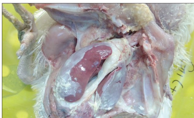
Figure-3: Infected chick with multidrug-resistant-extended-spectrum beta-lactamases producing Escherichia coli with no treatment administered (positive control) showing severe fibrinous formation on the heart, liver, and air sacs.