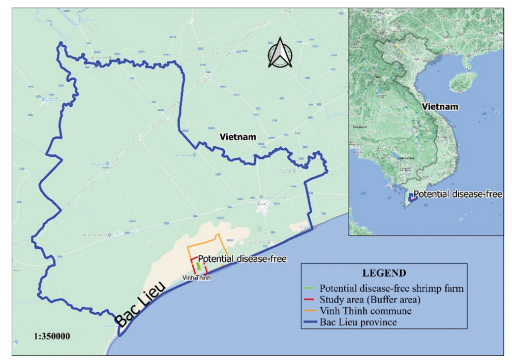
Figure-1: Buffer area in Vinh Thinh commune, Hoa Binh district, Bac Lieu Province, Vietnam [Map prepared in QGIS software].

The Laboratory of Regional Animal Health Office number VII under the DAH, accredited ISO 17025, conducted the following tests: white spot