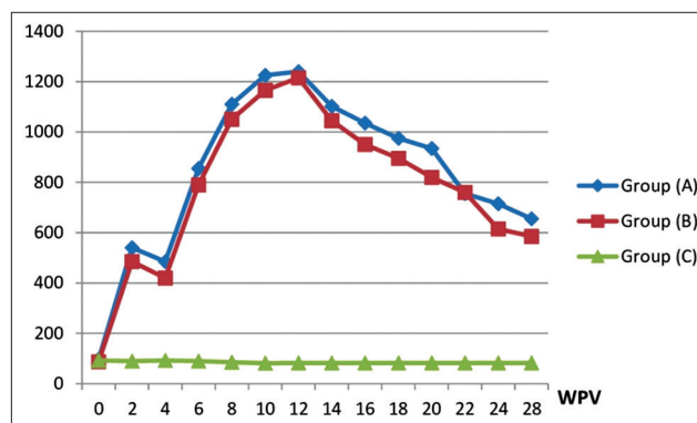
Figure-2: Equine herpesvirus-1 (EHV-1) enzyme-linked immunosorbent assay antibody mean titers in horses vaccinated with the inactivated EHV-1 vaccines. Group (A): Inoculated with the prepared inactivated EHV-1 vaccine. Group (B): Inoculated with the commercially produce inactivated EHV-1 vaccine. Group (C): Kept without inoculation as control at the same conditions of the experiments. WPV=Week post-vaccination.

The equine industry is economically important in many countries, especially in Egypt and elsewhere in the Middle East. EHV-1 causes respiratory symptoms, abortion in mares, the birth of weak, nonviable foals, and even sporadic paralytic neurologic disease [1-3]. Efficient vaccination in combination with good animal management is the best strategy to prevent and control outbreaks of the disease, especially using the inactivated vaccine in endemic areas [7]. EHV-1 vaccination is important to ensure protective immunity in foals during the 1 st weeks after delivery [35]. An effective vaccine requires a preferable antigen and a