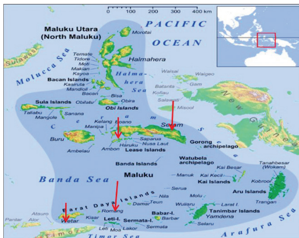
Figure-1: Locations of tick collection on cuscus on Wetar, Romang, Ambon, and Seram Islands (Source: https://id.wikipedia.org/wiki/Kepulauan_Maluku ).

Cuscuses were captured using a method involving imitation of their sounds to lure them out of the undergrowth. This is a well-recognized approach locally. When a cuscus jumped from one branch to another and reached the point where the sounds originated, it was