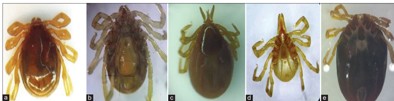
Figure-3: Morphology of Ixodes cordifer . (a) Dorsal (male); (b) ventral (male); (c) dorsal (female); (d) ventral (female); (e) ventral engorged (female). Magnification 20x.