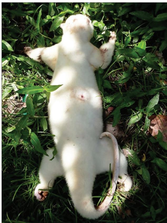
Figure-2: Cuscus caught and anesthetized.

The structure of the ticks was analyzed descriptively according to existing references. The level of tick infestation was categorized according to the intensity of the ticks. When between 1 and 25 ticks were found on one cuscus, this was categorized as mild infestation, between 26 and 50 as moderate infestation, and 51 or more as severe infestation [17]. The prevalence of tick infestation and its intensity was calculated in accordance with a previous report [18].