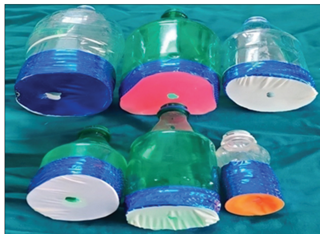
Figure-3: Custom-made face mask for birds.

The feather plucking, pharyngeal, and toe pinching reflexes were noticed when the birds were passing through the light plane of anesthesia using inhalation agents for induction. The quality of analgesia achieved better in the butorphanol tartrate pre-medicated avian patients as compared to without butorphanol tartrate premedication. No befitting literature could be traced while screening the reference to substantiate