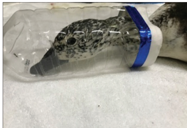
Figure-1: Avian patients induced by custom-made face mask.

The quality of induction was scored subjectively as follows: EXCELLENT: Assumed no struggling/avoidance behavior. VERY GOOD: Assumed minor avoidance behavior (random head and body movements), no vocalization. GOOD: Assumed purposeful