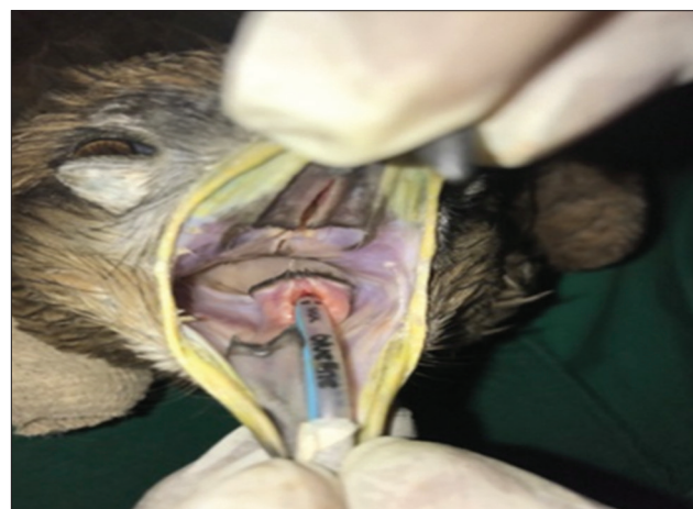
Figure-2: Kite intubated by uncuffed endotracheal tube.