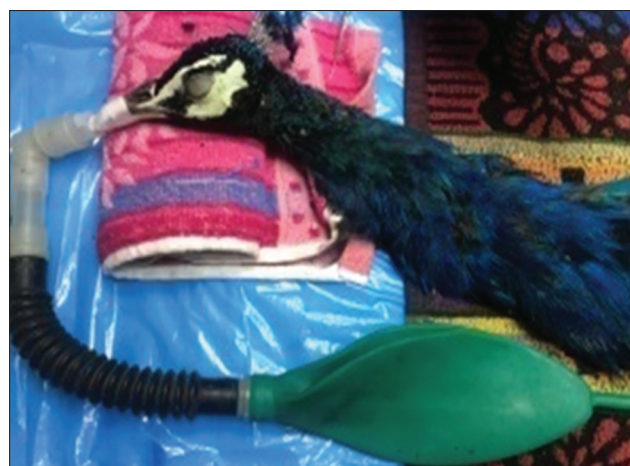
Figure-4: Maintenance of anesthesia by inhalation anesthetic agents in Indian peacock.

The Mean \pm SE value of recovery time was found to be the shorter in Group-IV (140.00 \pm 12.64 s), followed by, in an ascending manner, Groups-III (160.00 \pm 29.66 s), -II (190.00 \pm 28.63 s), and -I (220.00 \pm 42.89). The details of the results are presented in Table-7. Comparison of the time of recovery between Group-I versus -III and Group-II versus -IV was revealed non-significant differences. Birds under sevoflurane protocols had a rapid onset of recovery