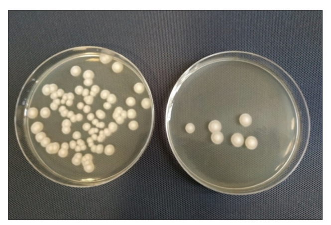
Figure-2: Colonies of microorganisms present in curd cheese samples cultured on Sabouraud medium.

Means marked with different letters differ significantly: capital letters - for p \le 0.01 ; lowercase letters - for p \le 0.05