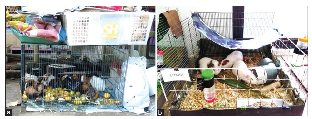
Figure-1: Housing of guinea pigs (GPs). (a) GPs in uncontrolled environment and (b) GPs in controlled environment.

For 2 months, we raised GPs as the controlled environment group in the animal facility, following the standard guidelines for care and management that refer to their basic needs, particularly housing, environmental factors, sanitation, and welfare [17–21]. During the study, the boars and sows in the controlled environment group significantly gained weight and