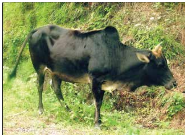
Figure-1: Adult hill cattle of Himachal Pradesh.

Where, Y is the phenotypic observation for one of the 17 biometric traits, \mu is the overall mean, D_i is the fixed effect of district, while e_{ij} is the random residual error associated with each observation which is normally and independently distributed with mean zero and unit variance. Means, standard error and coefficient of variation were calculated. Pearson's correlations (r) among various morphometric traits were estimated.