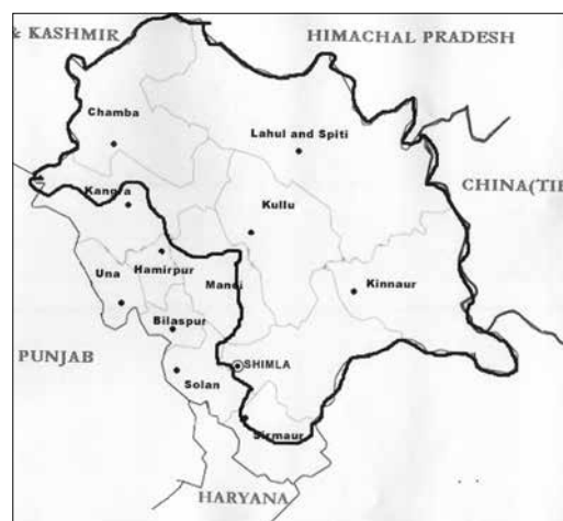
Figure-2: Map depicting the breeding tract of hill cattle of Himachal Pradesh.