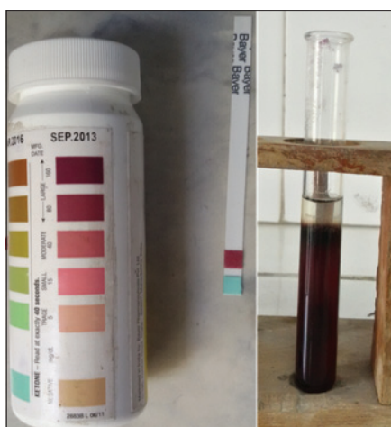
Figure-1: Positive result of Rothera's test and Keto-Diastix strip test.

Data were expressed as mean ( \pm standard error of the mean) and analyzed by applying independent Student's t -test using SPSS statistical software.