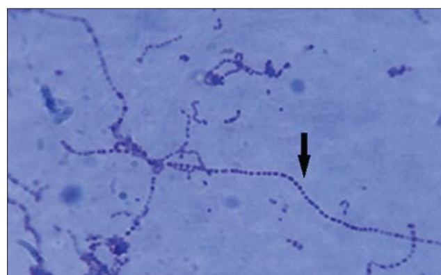
Figure-1: Long chains of Streptococcus equi subsp. equi Gram-staining.

The summary of the results of antibiotic sensitivity of two isolates of S. equi ssp. equi are shown in Table-5. The results revealed that amoxicillin and rifampicin were the most effective followed by streptomycin while maximum resistance was noted against penicillin G. Both the streptococcal isolates demonstrated intermediate