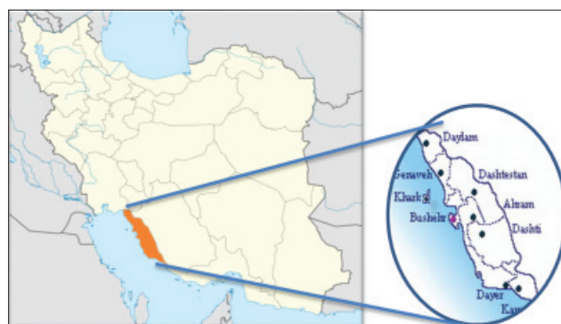
Figure-1: Map of Iran and study area.

The average size of trophozoite of B. coli and average size of macro nucleuses were 80 \mu\text{m} \times 62.5 \mu\text{m} and 21.5 \mu \times 11.5 \mu , respectively. The proportion of length to the width was 1.86 \mu\text{m} . No significant association was found between protozoa infection and weight or age of the examined boars ( \chi^2 = 1.64 , df = 3 , p > 0.05 ).