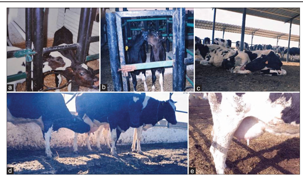
Figure-1: Photos from calves and cows involved in abnormal oral behavior. (a, b) Cross-sucking in calves after bucket feeding, (c) A cow engaged in self-sucking while the rest of the group was feeding), (d) A cow is sucking its neighbor, (e) teat elongation in a cow was involved in self- and cross-sucking.