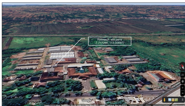
Figure 1: The location of the research was at the Indonesian Beef Cattle Research Station in Grati District, Pasuruan Regency, East Java Province, Indonesia.

Blood (10 mL) was collected from the jugular vein at 4 h after feeding. The samples were analyzed for