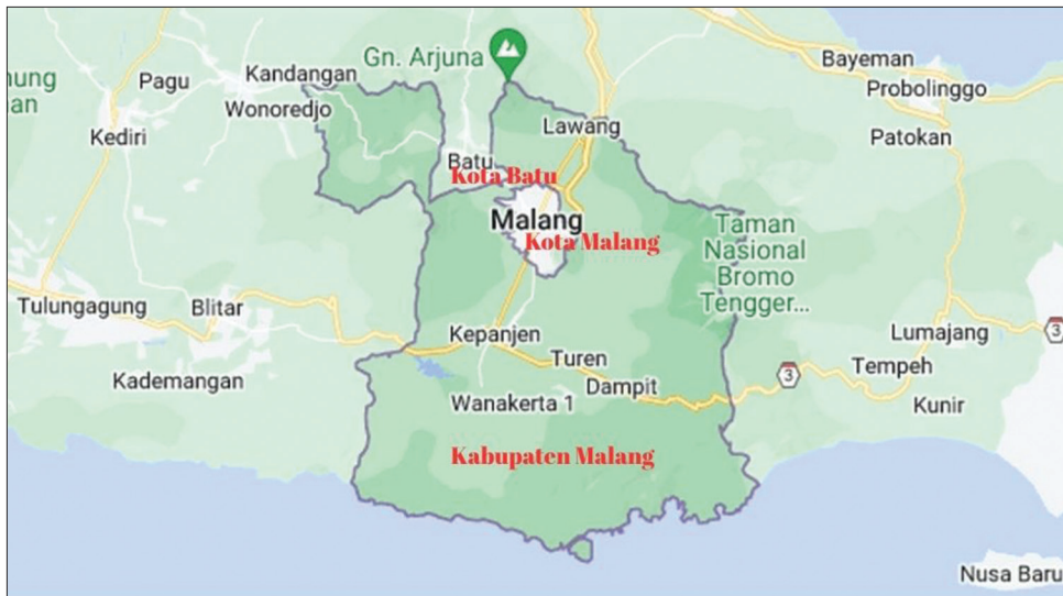
Figure 1: Map of research locations in Malang, East Java, Indonesia.